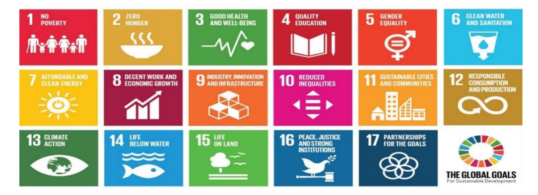
Fig-1: 17 SDGs

Improved coordination, alignment of policies with SDGs framework, data reporting and effective monitoring and investment in corresponding sectors of SDGs through Annual Development Programme can help in achieving the 2030 SDGs agenda.